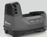
C1800X PACE Charger K1 SAFE 58532030