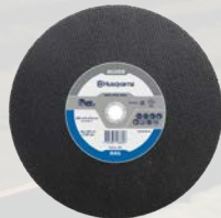
Vario-Disc Rail 14"/355 Husqvarna Original SAFE 58533110