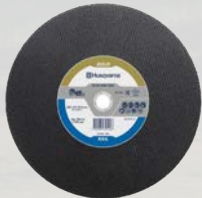
Elite-Disc Rail 14"/356 Husqvarna Original SAFE 58533113

K 1 PACE Rail is specifically designed for work on railways, tram tracks, and subway systems. It cuts quickly and precisely, the accessory is easily mounted on the rail, and the dual mounts allow cutting from all angles.